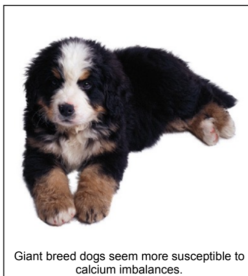
Giant breed dogs seem more susceptible to calcium imbalances.

Although in general, calcium absorption is dependent on both calcium requirements and dietary intake, young puppies have an impaired ability to regulate their calcium absorption. As a generalization, this ability to regulate calcium absorption does not develop until the puppy reaches at least ten months of age. Smaller