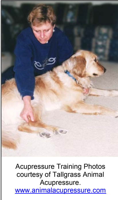
Acupressure Training

The term acupuncture is from the Latin, “acus” meaning ‘needle’ and “punctura” meaning ‘to prick’. Acupuncture, in its simplest sense, is the treatment of conditions or symptoms by the insertion of very fine needles into specific points on the body in order to produce a response. Acupuncture points can also be stimulated without the use of needles, using techniques known as acupressure, moxibustion, cupping, or by the application of heat, cold, water, laser, ultrasound, or other means at the discretion of the practitioner.