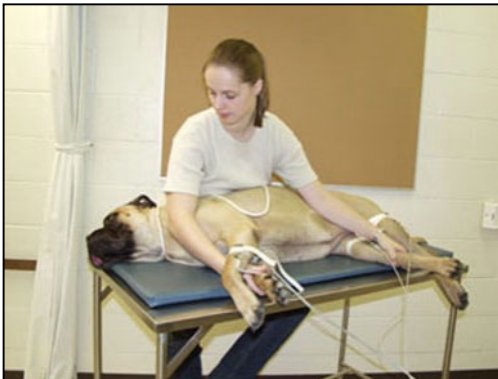
Gentle restraint is usually all that is necessary for acupuncture in pets.

Because of the differences in anatomy, and the potential for harm if the treatments are done incorrectly, only a properly trained veterinarian should perform acupuncture on animals. The American Veterinary Medical Association and the Canadian Veterinary Medical Association both consider the practice of acupuncture to be the practice of veterinary medicine, and as such, should only be performed by a licensed veterinarian.