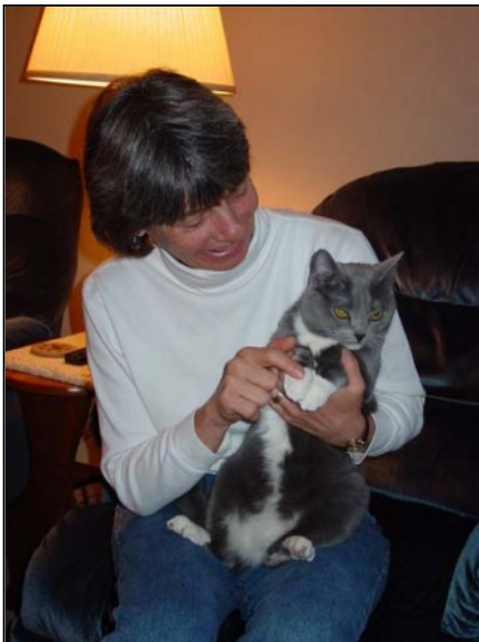
Acupressure Training

Acupuncture should never be administered without a proper veterinary diagnosis and an ongoing assessment of the patient's condition and response to any prior treatment. This is critical because acupuncture is capable of masking pain or other clinical signs and may delay proper diagnosis once treatment has begun. Elimination of pain may lead to increased activity on the part of the animal, thus delaying healing or worsening the original condition.