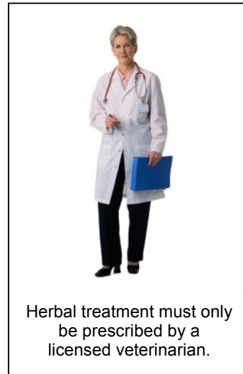
Herbal treatment must only be prescribed by a licensed veterinarian.

veterinarian should prescribe herbal treatments. The American Veterinary Medical Association and the Canadian Veterinary Medical Association both consider the practice of veterinary herbalism to be the practice of veterinary medicine. In accordance with regulations in the local jurisdiction, herbal treatment must only be prescribed by a licensed veterinarian, or under the direct supervision of a veterinarian. As veterinary herbal treatment grows as a specialty, there are increasing numbers of veterinarians in private practice who have obtained the necessary training and experience in herbal medicine. In many cases, referral is not necessary, but should be considered for the herbal management of very dangerous, refractory, or delicate conditions.